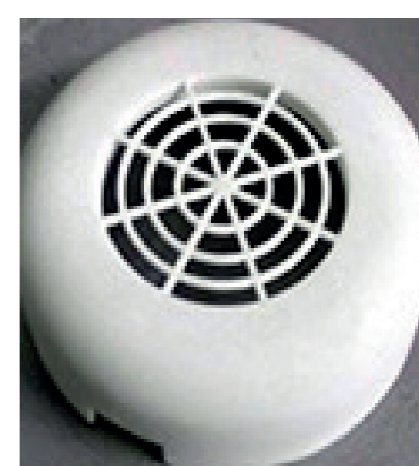
Fan Cover (107mm diameter).

Fitting: Just drill 72mm diameter hole in wall of HOUSE, CARAVAN, BOAT, all fixings supplied (double side tape, screws, etc).