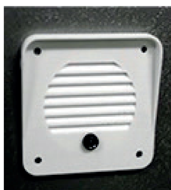
Vent (90mm x 90mm) & cover. NOTE: cover only required for boat when at sea.