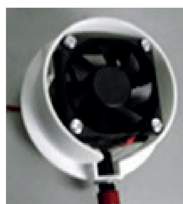
Fan Housing Includes ON/OFF switch and fan (60mm x 25mm).