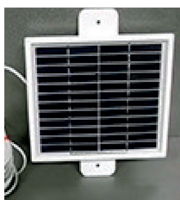
Solar Panel (160mm x 190mm) 3W including 5m Cable.