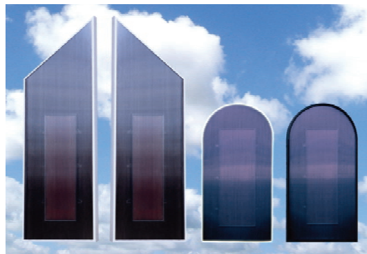
SV12 "Freeline" and SV9 "Rounded" models